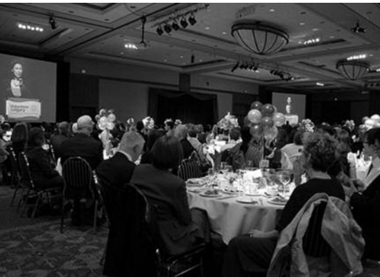
The Palomino Room was bustling with volunteer spirit.

The global economic crisis may have cast a shadow over cities the world over this year, but it did very little to dampen the volunteer spirit in Calgary.