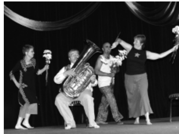
The performers from Volunteer Calgary member, MoMo Dance Theatre opened the show.

The evening kicked off with cocktails, a message from the Mayor of Calgary, and a dance number by MoMo Dance Theatre, a performance group consisting of talented individuals with mixed abilities. The awards ceremony, which was emceed by Darrel Janz, commenced shortly after dinner. As the inspiring stories dramatically unfolded on the screen, the room